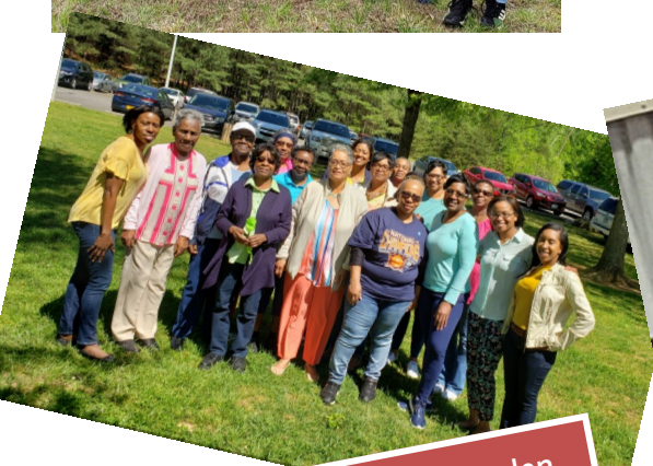
Women's Fellowship Garden Party

On Saturday, April 20th, Sunday School held the annual Easter egg hunt. It was a fun-filled afternoon, complete with hot dogs & burgers and kite-flying!