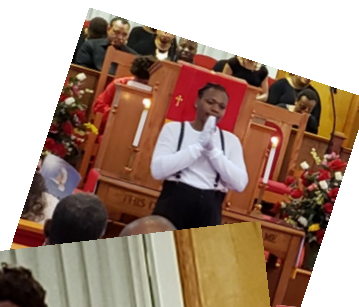
17th Pastor & People Anniversary