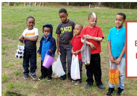
Easter Egg Hunt 2019

Go ye therefore, and teach all nations, baptizing them in the name of the Father, and of the Son, and of the Holy Ghost. Matthew 28:19