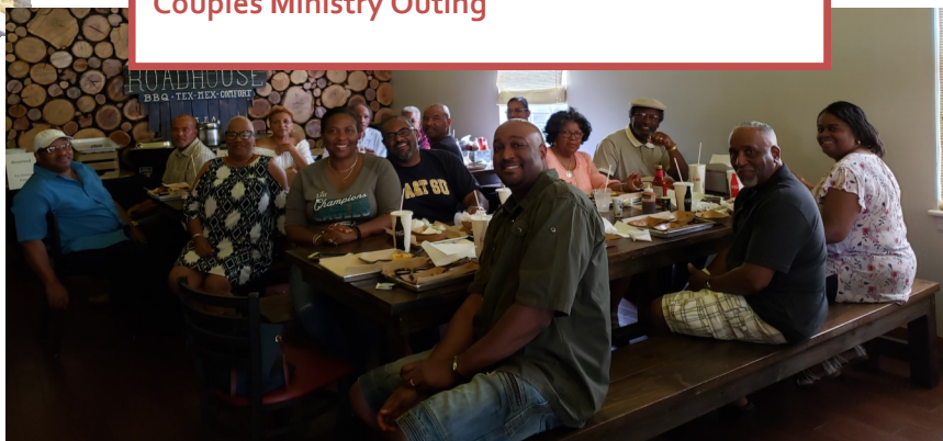
Couples Ministry Outing