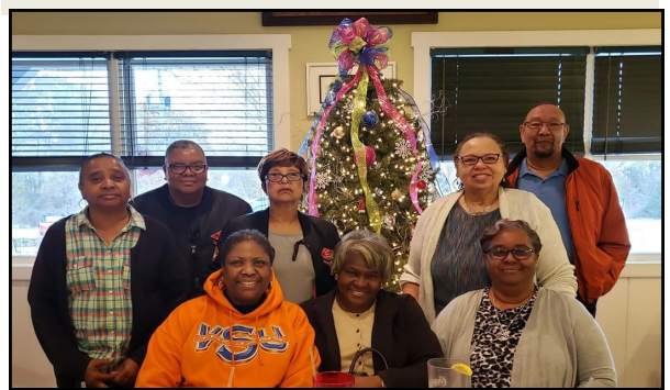
Senior Adult Choir Holiday Lunch November 23, 2019

Thanks to the cast and crew for all of their performance and hard work making everyone laugh, making us all think and impacting the entire audience of people. I know it was not easy, God knows the practices we had, but when it was time to perform, you all became characters. You may never know how this performance inspired others, so thank you. Your family, friends and church couldn't be prouder of you.